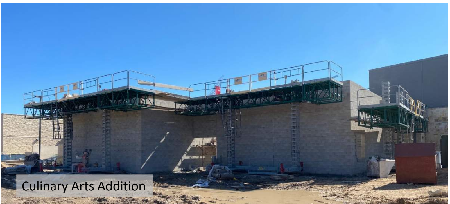
Culinary Arts Addition