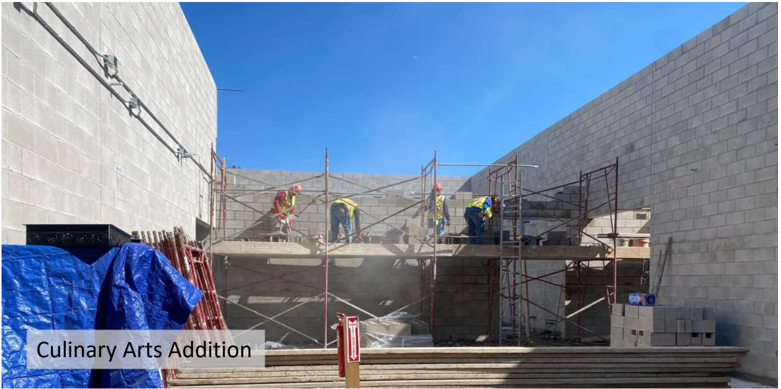
Culinary Arts Addition