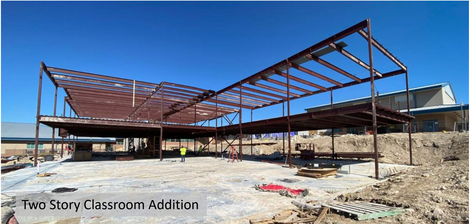
Two Story Classroom Addition