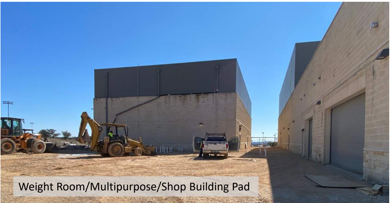
Weight Room/Multipurpose/Shop Building Pad