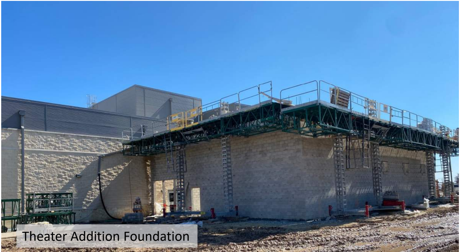
Theater Addition Foundation